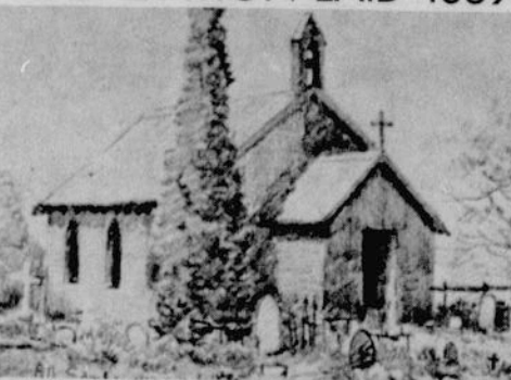
All Saints' West Swan, WA, whose foundation-stone was laid October 31, 1839. Built of mud brick, these were replaced by burnt bricks 1858-60.