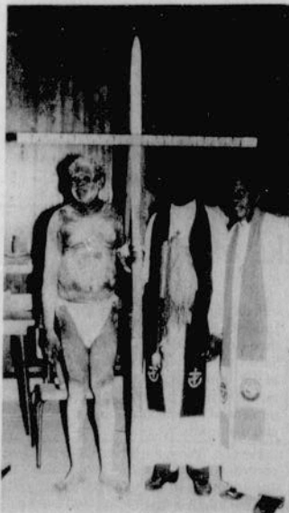
Ordination at Maningrida.

Other missiological reasons can be advanced such as the predominance of white leadership in mission times. This meant that a deep sense of Aboriginal Christianity remained incipient until it could become rooted in the cultural life of the people. Many missionaries have experienced the natural way Aborigines can defer to even a mildly assertive white leadership in decision-making. Far fewer were the good missionaries who were sensitive enough to adapt to the indirect and circular approach of rural Aborigines in making a corporate decision. They are the ones remembered and revered by Aborigines by the measure of the close personal relationships that became established.