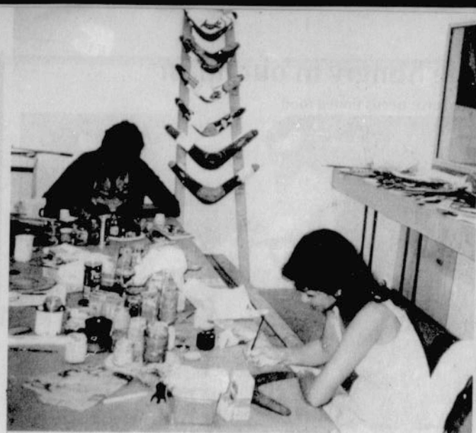
Students learn traditional painting techniques at Anuaka Arts and Crafts Centre in North Queensland. The centre is one of many projects assisted through the Aboriginal and Islander Development Fund. (Force 10)

Aboriginal people from the three Anglican communities in Cape York in the diocese of Carpentaria have also participated in extension courses through Nungalinga and its Queensland branch