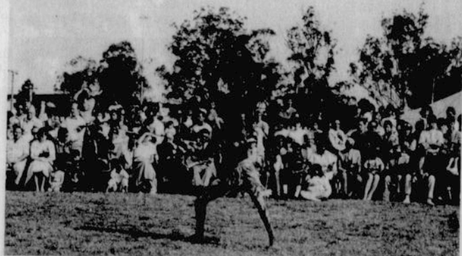
Ramingining Aboriginal Dancers

The Spirit of God is doing wonderful things for Aboriginal people too but also