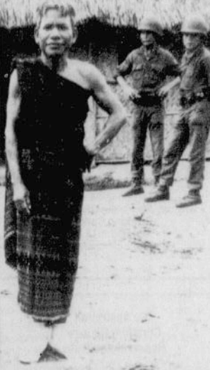
Katu chief dressed up for special dancing ceremony. 2 Vietnamese soldiers in background.

The Vietnamese are mostly Buddhist, but she had come to bring the Gospel to the tribal people; thirty thousand in the Katu mountains. They are an entirely different background from the Vietnamese, who come mostly from China. The tribal people came across from Cambodia. They are dark skinned people nothing like the Vietnamese.