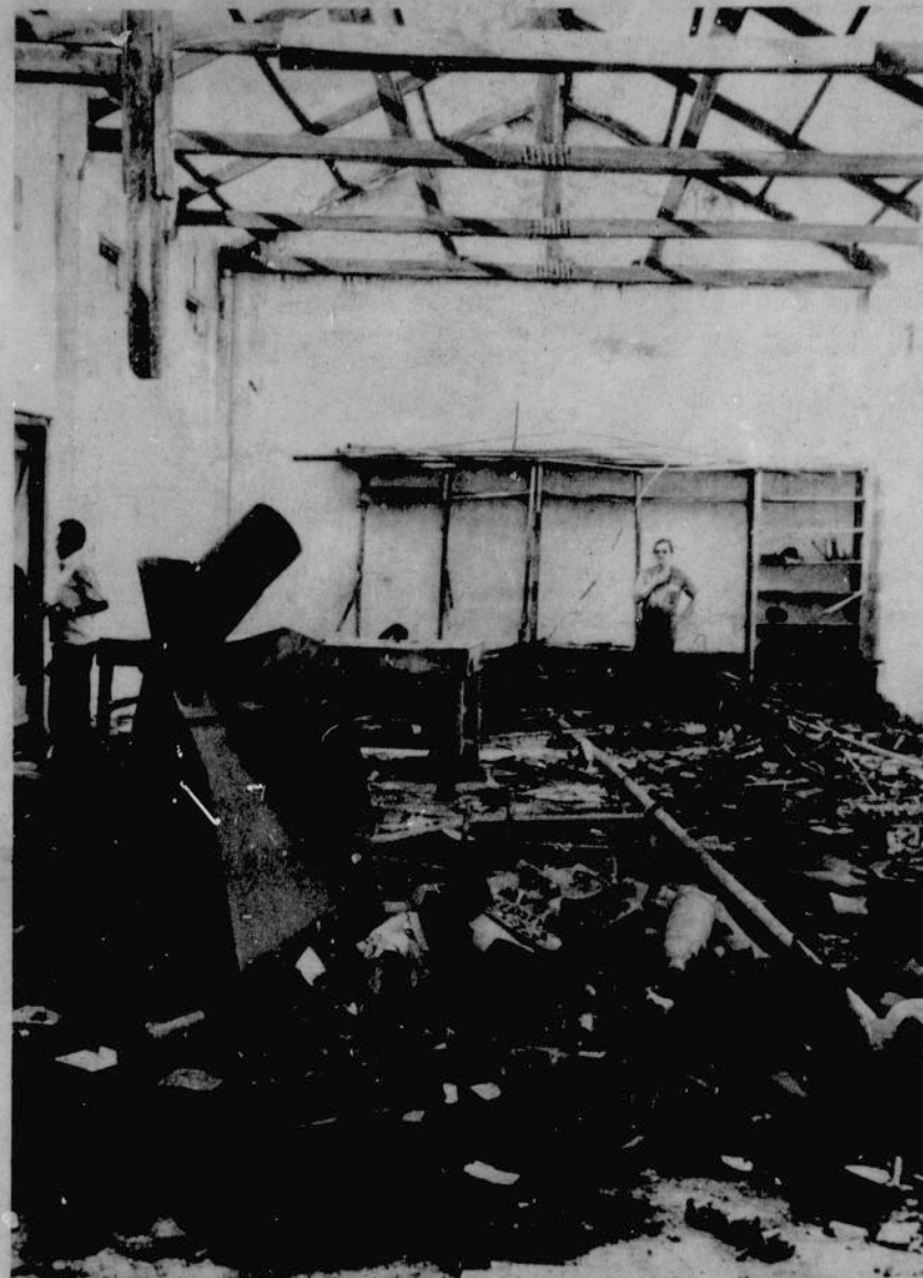
The remains of the Balayi coffee processing plant at Masaka in Uganda, which is owned and operated by the Church of Uganda. Coffee to the value of 3,000,000 shillings ($375,000) was destroyed during the war of liberation and 300 employees put out of work. First hand account, page 2.