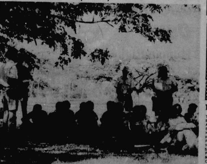
A regular service conducted by full-time chaplains of the Forces.