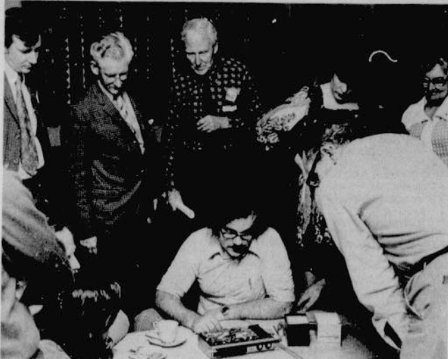
Friday evening, October 10, The Association of Christian Technicians (TACT) combined with Gospel Recordings Inc to conduct a Cassette Seminar in the Concord Baptist Church, Sydney.

A display of available Gospel Recording equipment attracted the attention of those from various mission organisations and individuals from a wide cross-section of Sydney churches, interested in cassette outreach.