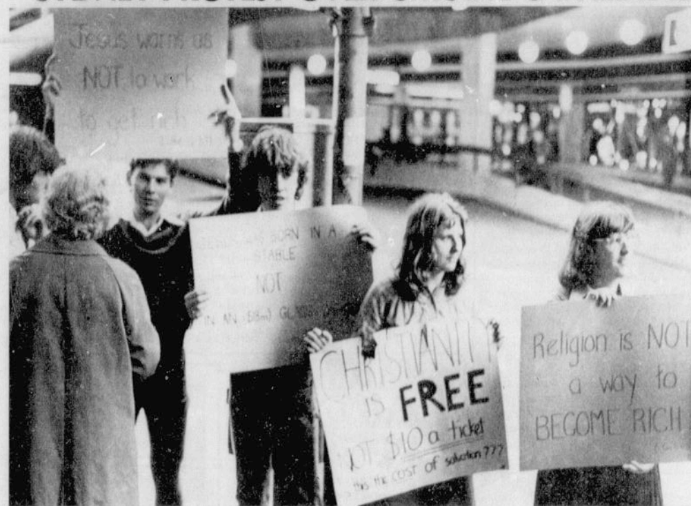
A group of demonstrators protested outside the Sydney rally of Dr. Robert Schuller who defended his $18 million Crystal cathedral recently in Australia.