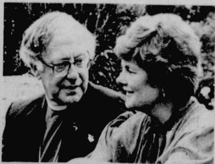
The Archbishop of Canterbury and Mrs. Runcie.

The Church of England House of Bishops made the following statement on Tuesday 21 October: