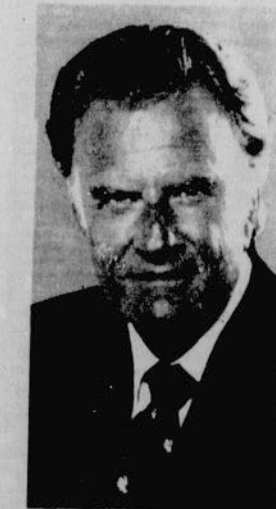
Dr. Billy Graham.