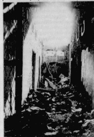
Photograph shows damage in the recent fire which caused $150,000 damage to buildings and equipment.