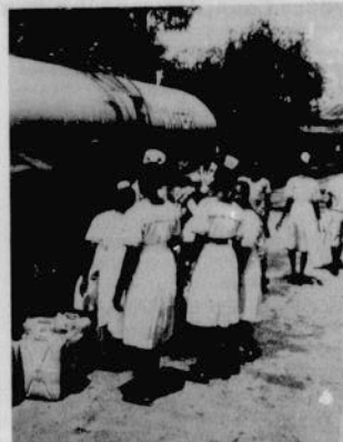
Nurses at Mengo Hospital filling cans with water. The hospital of 190 beds has no running water. Supplies in the dry season are brought by this lorry. Maternity and operating sections find this very difficult.

"He has also encouraged many people overseas to donate money for equipment to make up for our losses."