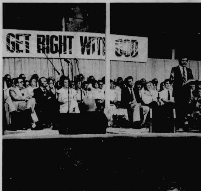
The message is the same — but the text on the banner is for "Saints" and "Sinners" alike!