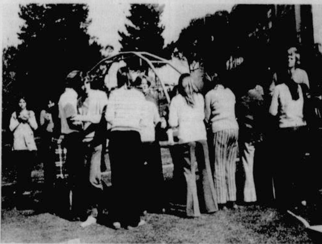
ISCF Senior Leadership Conference at the Grange.

ISCF, the schools' branch of Scripture Union is there not only to provide support for Christian students but to represent Christ in school communities. About 700 groups meet in secondary schools around Australia, with the approval of the State Education Departments and individual school principals.