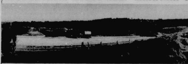
This panoramic view shows land involved in a sub-division behind the Church of England Homes at Carlingford, NSW — at the intersection of Jenkins Road and Moseley Street.