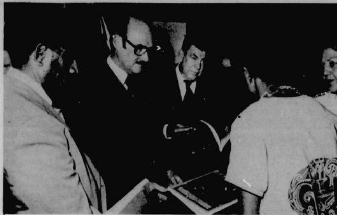
An art exhibition from Papua New Guinea to aid the Bible Society was organised recently by Grace Bros (department store) of Chatswood, NSW.

Post coupon to The Church Record Ltd, Room 311, 160 Castlereagh St, Sydney, NSW, 2000.