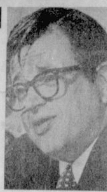
Mr Charles Colson

down mine as I felt that night a tremendous surge of strength and the thrill of Christ's presence," he said.