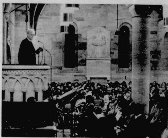
Pastor Richard Wurmbrand preaching in St John's pro-Cathedral, Parramatta, NSW, December 5.

The bishop has also appointed Archdeacon