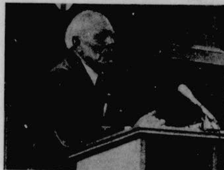
Mr Malcolm Muggeridge

Asked during a 20-minute question period if he