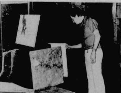
Ceiling tiles adorn the foyer of the School's Hospital, at the Church of England Preparatory School, Toowoomba.