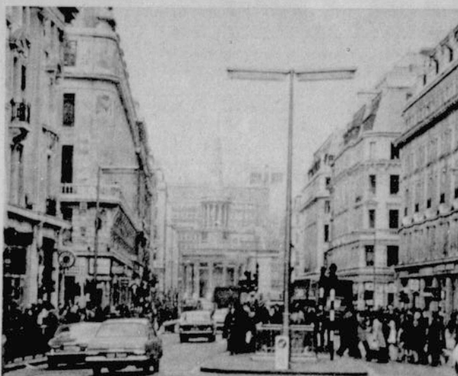
All Souls, in the heart of London's West End, seen from Oxford Circus

have kindly given me a little flat in which I live.