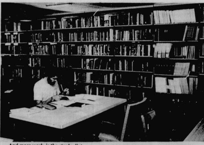
... And more work, is the staple diet.