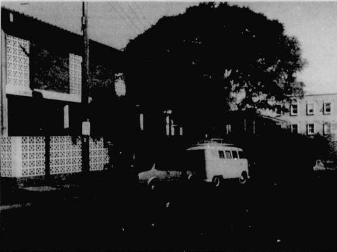
Dining Room, Lecture Room, Deaconess accommodation.