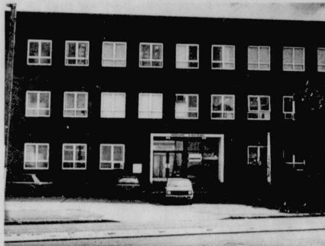
Thanks to generous friends, Moore College has recently acquired an Administrative and Library block.

must be an understanding of God's revelation, the basic skill must be that of a good teacher and evangelist who is able to facilitate learning and who offers a deep pastoral concern for those in his care, and the basic attitude must be a love that expresses itself in service and prayer.