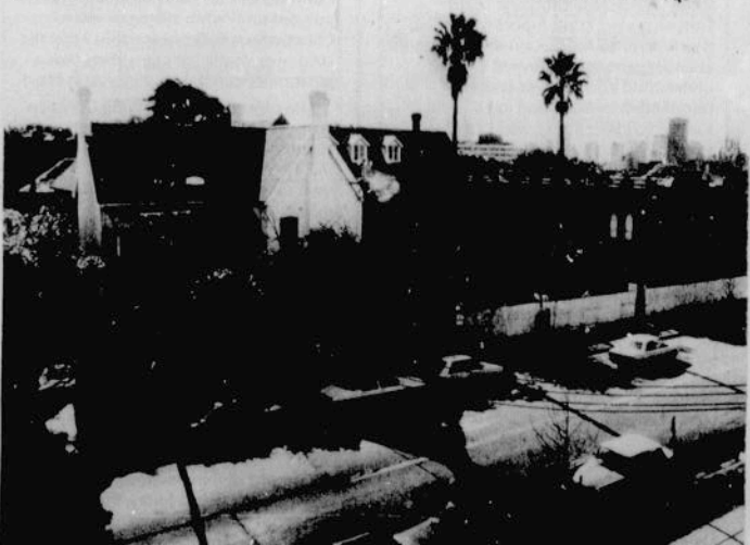
Original buildings date back to 19th Century.