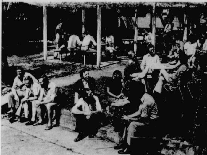
... Some recreation

Yet, the statement and the pursuit of that goal was against a background of both Anglo-Catholic and evangelical subjectivism. Through the 1950's some of the students' rooms were like Chapels — with religious pictures, crosses, crucifixes, even Rosary beads and holy water "Specially blessed by the Bishop of Norwich"! Excursions to Christ Church St. Laurence were not unknown. Other students, embracing an evangelical ethos