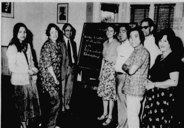
Bible and Missions Course.

"All this may look like an ideal impossible of attainment, a counsel of perfection. It will doubtless be pointed out that many excellent Clergymen have never followed it ... we must not take the man of exceptional personality ... character and drive,