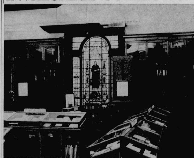
The Tyndale Memorial Window overlooks the priceless collection of Bibles and Bible manuscripts specially housed at Bible Society headquarters, London.