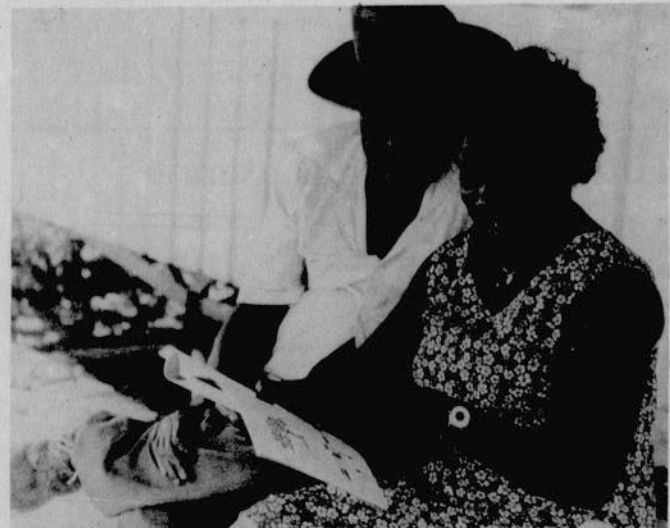
An aboriginal couple at Borrolooloo, N.T., learning to read.

Wycliffe is interdenominational and non-sectarian, serving all churches and missions, drawing its workers from a wide spectrum of denominations. A substantial number of Australian Wycliffe workers are Anglican supported by Anglicans. They follow in the tradition of one John Wycliffe who, as the "Morning Star of the