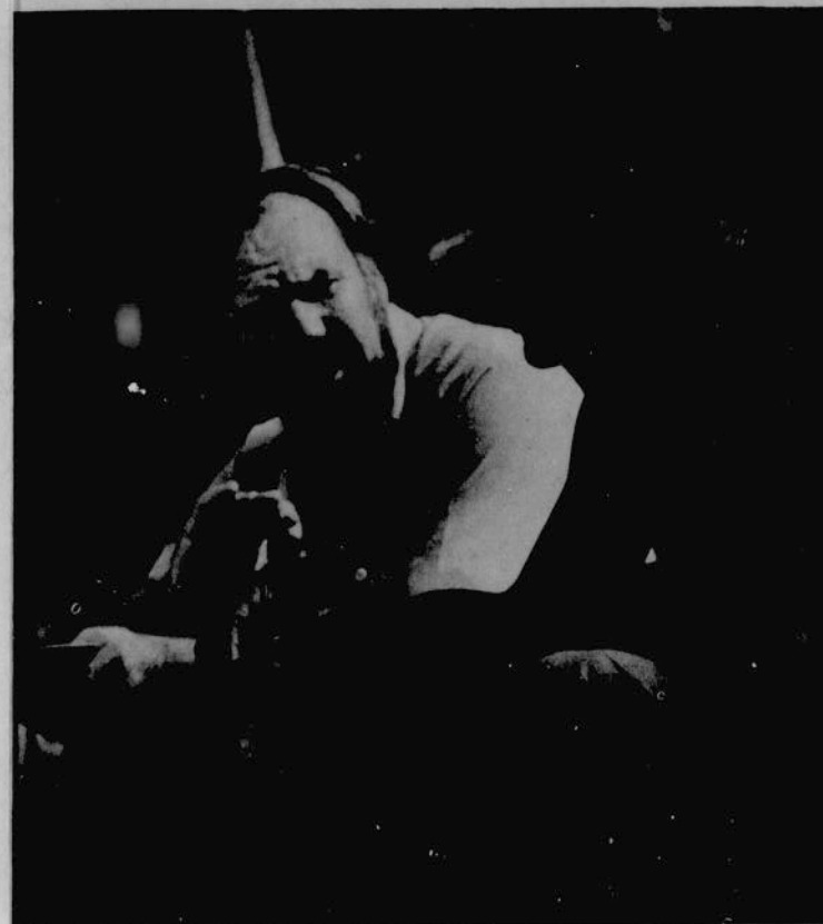
A Wycliffe translation with his language helper.

A 19th Century visitor to Scotland, the Protestant historian Merle D'Aubigne, wondered why the gospel had worked best in Scotland of all Reformed countries. His conclusion: "Her attachment to sound doctrine," unimpeded by inordinate preoccupation with apocalyptic speculation. "You can see," commended d'Aubigne, "that the Christian spirit has been transfused into them, not from the weakened off-shoots of the Romans, but from a young vigorous and indigenous stock." John Knox maintained close and regular fellowship with Protestant churches in England and on the Continent and this tempered the spirit of Scottish nationalism during those eclipsing years. Occupied for long years in ceaseless struggle against opposing forces he became as he said, "weary of the world" and "thirsting to depart". He was buried in Edinburgh, the Regent of Scotland speaking over his grave the long remembered words, "Here lies one who never feared the face of man."