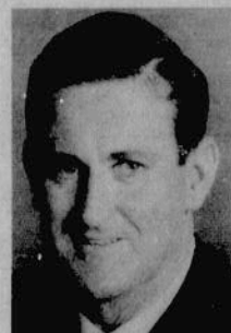
Rev Fred Nile

"Urgent action is needed to strengthen the family as the basic and natural unit of our society," said Mr Nile.