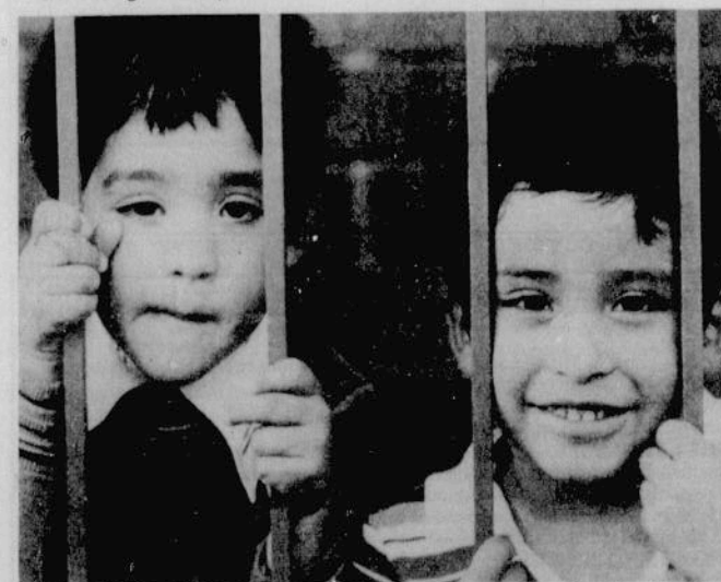
What is our future in our new country? Two of the children typical of those involved in HMS programmes.