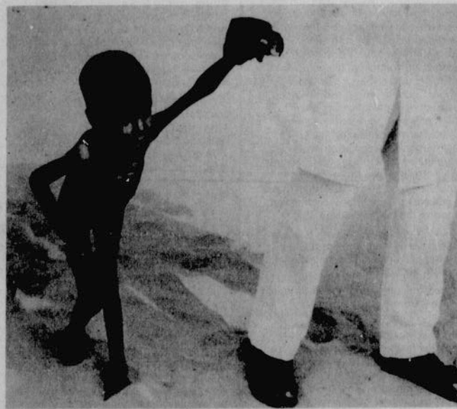
Behind the continuing world problem of famine, lies inexpressible personal tragedy

What we now see in Ethiopia is a clear expression of the paradox of love which Jesus' gospel brings. As the Christian West feeds the dying citizens of Ethiopia, their government closes local churches. Australian aid agencies have also observed the scene.