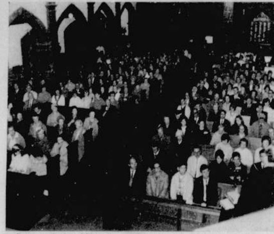
Some of the 300 who gathered each night from June 19 to 25 at St. Alban's, Lindfield, for the Lay Institute of

Please mention "Church Record" when replying to our advertisers.