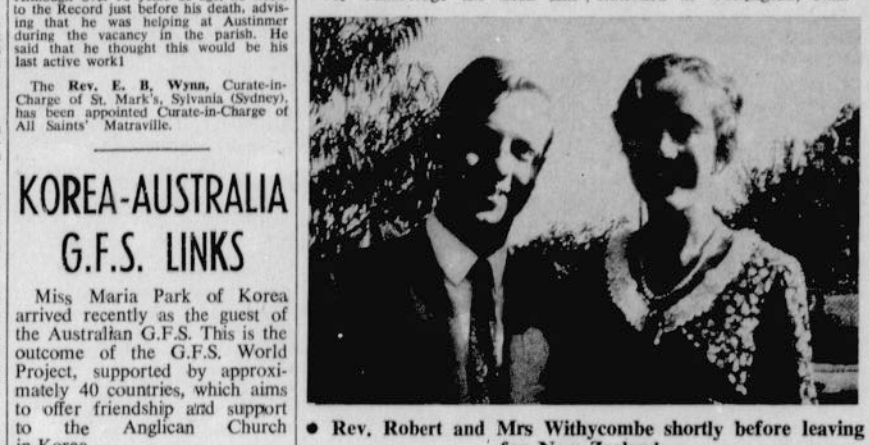
for New Zealand.

orked for a London B.D. with lockours. At Cambridge his field has stationed in Wellington, N.Z.