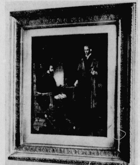
John Calvin (1509-1564) (seated) and Philip Melancthon (1497-1560) leading Protestant reformers of France and Germany who greatly influenced the English Reformation.