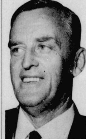
The Premier of Queensland, Hon. J. Bjelke-Petersen.

The Premier (Mr Bjelke-Petersen) said Cabinet considered the