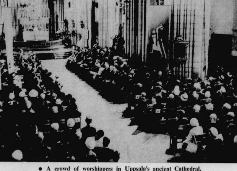
• A crowd of worshippers in Uppsala's ancient Cathedral.