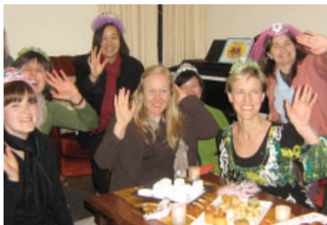
WOMEN AT AN ESTHER PARTY

The unique features of the conference include the systematic teaching of books of the Bible in consecutive years (so far the conference has covered 2 Corinthians, James and Esther), the high proportion of women aged between 18-35 and an annual elective topic which covers a gender issue from a complementarian basis. In partnership with Matthias Media, six of the electives have been incorporated into a cd pack entitled Different By Design - God's word to women in a gender confused world .