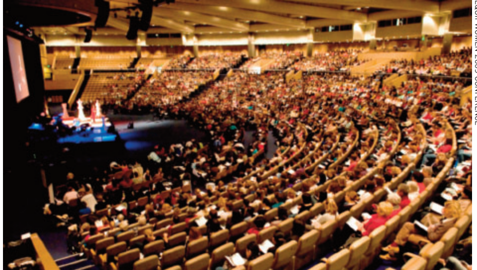
EQUIPWOMEN 2009 CONFERENCE